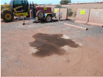
Oil spill to ground