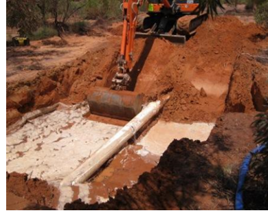
OBP tailings leak