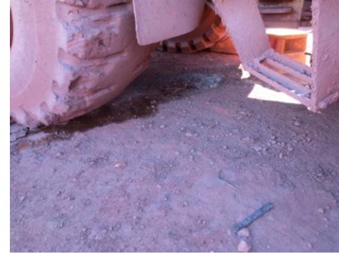
Hydraulic oil leak from truck