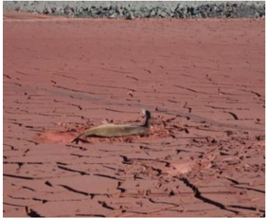
Impacts to fauna