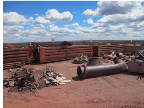
Large piles of scrap steel, cardboard & plastics left for long periods & not put in designated bins