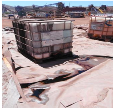
Oil spills/ leaks onto compromised temporary bunding