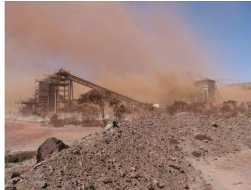
SMR fixed plant crusher dust- FDR 3