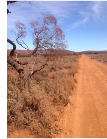
Unauthorised vegetation clearance