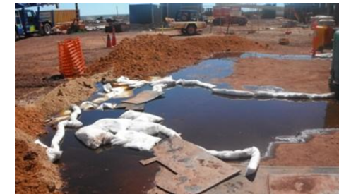
Large oil spill was from a temporary storage tank pump connection failure

REPORT spillage of oil, hydraulic fluid, fuel, acid, chemicals or other pollutants to: