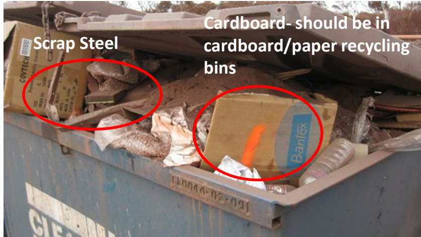
General rubbish bin – waste not segregated