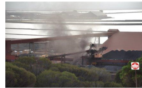
Pellet stacking dust- FDR 3 impacting off site