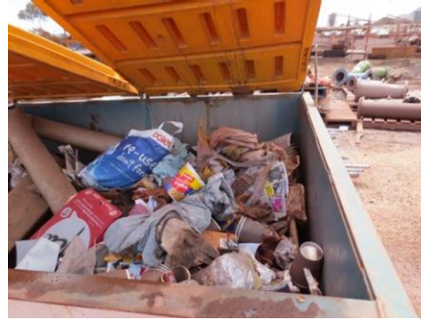
Paper/ Cardboard bin contamination