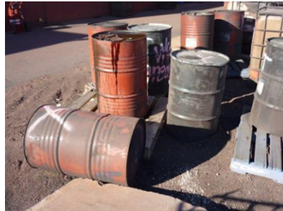
Un-bunded oil drums