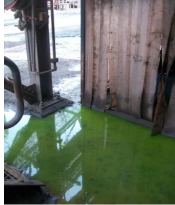
Coolant spill to ground