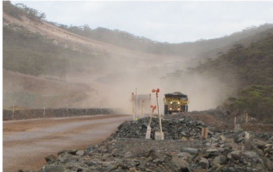
Excessive fugitive dust from vehicle- FDR 2