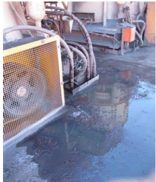
Oil spill from damaged hydraulic line