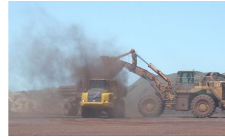
Material handling dust FDR 2 impacting outside of work area